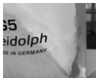
Fig. 1: Ice crystals form inside the G5 condenser

The evaporation of 50 ml water takes 06:30 min. While the pump was not contaminated, some of the water formed into ice crystals on the condenser because of the cold temperature (Fig. 1). Because of that ice formation, only 32 ml from the 50 ml could be recovered.