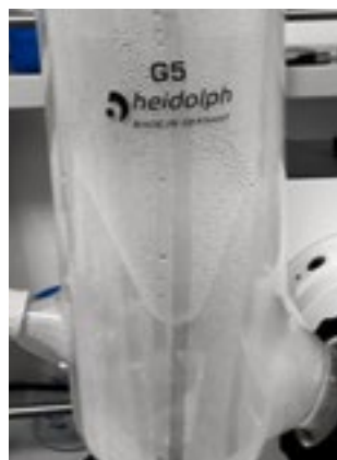
Fig. 2: Completely steamed G5 condenser after 17 min water evaporation

6 min after starting the evaporation of 250 ml water about half of the dry ice has already sublimated. After 14 min the vacuum starts to deviate and after 16 min all of the dry ice has sublimated. Shortly after the whole condenser is steamed up completely. (Fig. 2), the heat is not transported anymore. The pressure rises continuously and the process stagnates. Condensate forms inside the tubing (Fig. 3), indicating that the cooling capacity is not sufficient. The condenser gets so hot that the isopropanol starts to reflux, therefore the process was stopped after 30 min. 5 ml water were inside the pump, 15 were left in the flask. 230 ml were recovered.