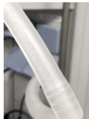
Fig. 3: Condensate inside the tubes during water evaporation with G5 dry ice condenser