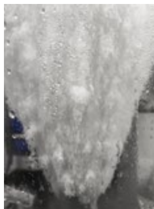
Fig. 4: Ice crystals from air moisture form inside the G5 condenser between processes

If the evaporator system is left open between two processes, meaning, if no rotation flask is attached, ice crystals from air moisture form inside the G5 dry ice condenser (Fig. 4). This can lead to contamination of the product with water when the next evaporation process is carried out. This formation of ice does not occur at the G3 XL cooling coil condenser.