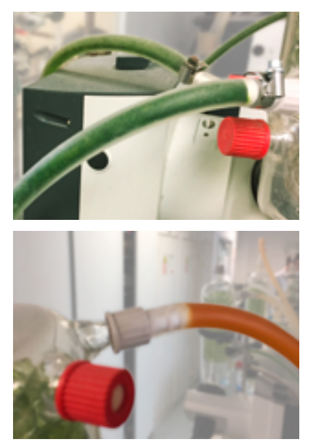
Fig. 3: Algae formation in the cooling coils and cooling water hoses