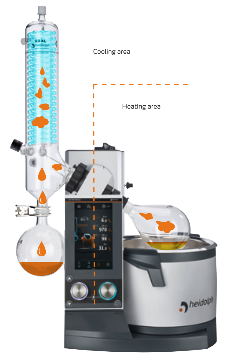
Fig. 1: Evaporation process on rotary evaporator

Choosing the right cooling system is therefore essential for a stable, safe and high-performance evaporation process.